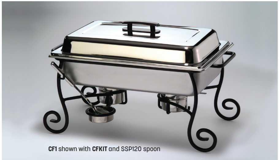
CF1 shown with CFKIT and SSP120 spoon