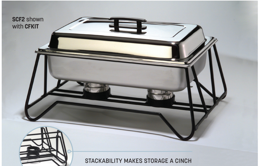
SCF2 shown with CFKIT

SCBL 21 1/4" L x 17 5/8" W x 18 1/8" H (54 x 44.8 x 46 cm)